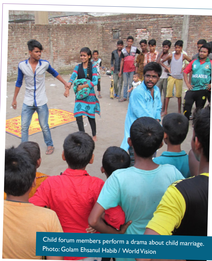
Child forum members perform a drama about child marriage.

Ghasful Child Forum members continue to bring child rights issues to the attention of national media and the government.