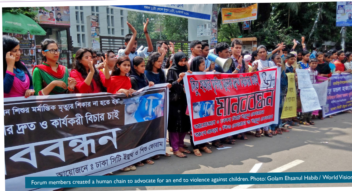
Forum members created a human chain to advocate for an end to violence against children.

After learning about issues affecting the children of their community, members of Ghasful Child Forum felt moved to act. Their social actions have made a big difference at a local, national and global level.